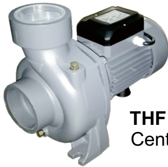
THF 6B Centrifugal Pump